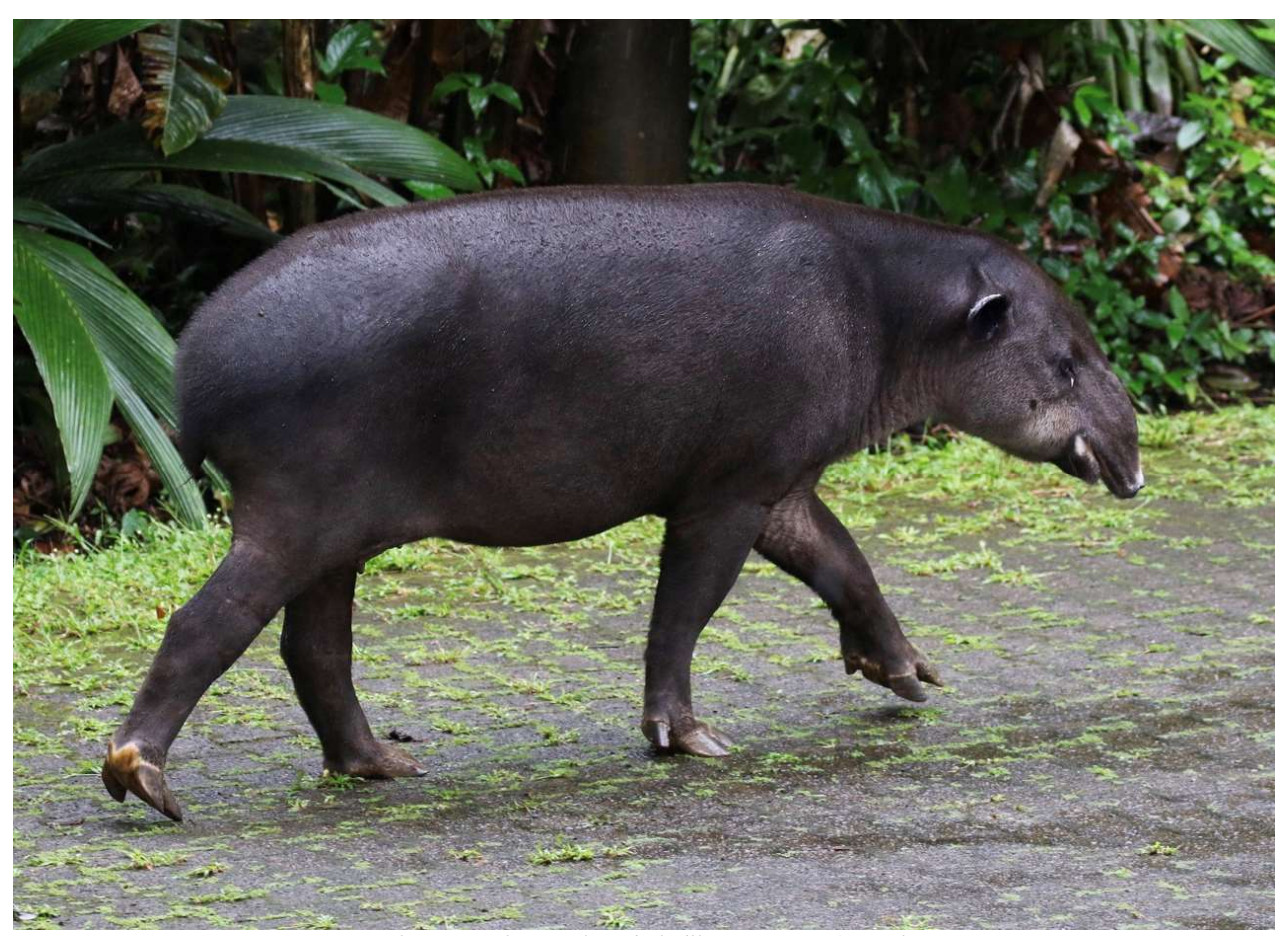
Baird's Tapir. Tapirus bairdii.

November 21, Day 6: Braulio Carrillo National Park and Rainforest Aerial Tram. Today we will have a full morning to explore the Braulio Carrillo National Park and an adjacent 1,100-acre private reserve. Created in 1978, Braulio Carrillo National Park encompasses a huge band of wet Caribbean foothill forest. In 1987, the road was finally completed, and the park opened to the public. Now birders have access to some of the country's rarest, least known and most restricted species in this fabulous area of steep forested slopes, cloud-filled valleys, and plunging waterfalls. We will devote all morning to the area, which will include an unforgettable 90-minute Aerial Tram ride, and hike along the trails on portions of the preserve. The tram ride enables us to traverse all levels of a Caribbean foothill rainforest canopy and later explore the rainforest trails on this privately-owned property.