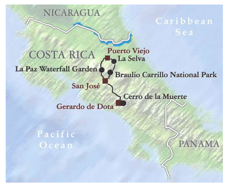
NIGHT: Hotel Bougainvillea, near San José

Participants should plan your flights to arrive San Jose, Costa Rica (Juan Santamaría International Airport, airport code SJO) today. After clearing customs and immigration you will be met by our local ground agent and transferred to the Hotel Bougainvillea where a room will be reserved in your name. Because most flights arrive San Jose this evening, there are no functions scheduled this evening and participants are on your own for dinner.