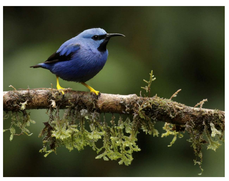
crowned Parrot. As the morning warms up, look Shinning Honeycreeper, Cyanerpes lucidus . up in the sky as a pair of Gray Hawk could be soaring around.

Our tour ends this morning with an early transfer to the San José airport for flights departing before noon today. Transfers for flights departing at other times can be arranged in advance at an additional charge. Please, note that the rooms and the grounds of Hotel Xandari are exceptionally beautiful. You might want to consider staying an extra day by your own to relax and enjoy birding in the area before returning home. The gardens have a level trail where you may see Rufous-andwhite Wren and Chestnut-capped Warbler. A pair of Lesson's Motmot usually hang around and the noisy Brown Jay visits the parking area. There will be also opportunities to see Bluevented Hummingbird (previously considered part of Steely-vented Hummingbird) and Whitecrowned Parrot. As the morning warms up, look