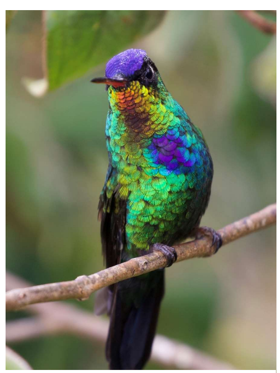
Fiery-throated Hummingbird, Panterpe insignis .

<u>November 17, Day 2: From San José to Cerro de la Muerte</u>. Our first morning birding will start right outside our rooms where pairs of Rufous-naped Wren give a cacophony of calls, while Costa Rica's national bird, the