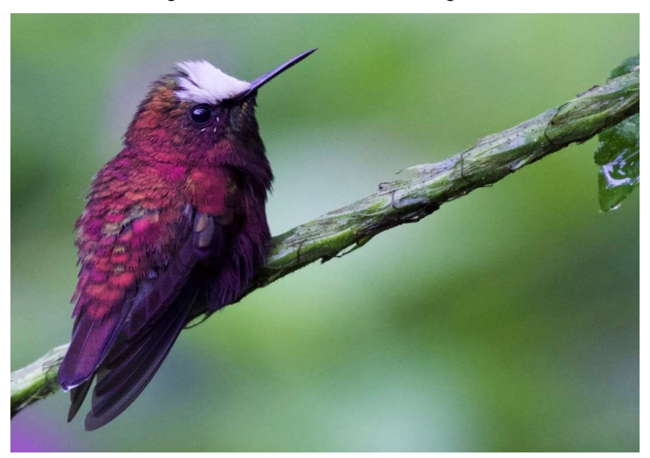
Snowcap, Microchera albocoronata.

<u>November 19, Day 4: From Cerro de la Muerte to Sarapiqui</u>. Our day will start with an optional pre-breakfast visit to the Batsu gardens, a location with hummingbird feeders and bird tables. The parade of tanagers and